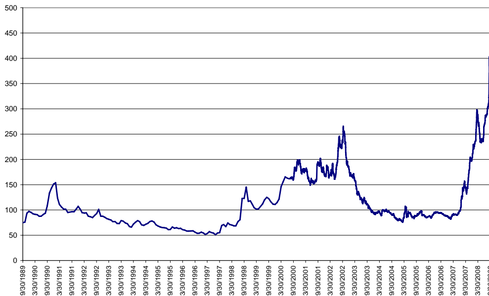
Figure 1: U.S. Corporate Investment Grade Yield* vs. U.S. Treasury Bonds

US and Canadian investment grade corporate bond yields are at historic highs, versus government guaranteed bonds, that defy imagination. When I saw the charts below, my jaw dropped, as these kinds of extremes do not come often in the markets and tend to signal a time to buy, rather than sell for the patient investor.